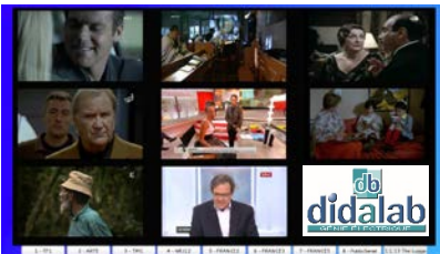
Video pattern of 8 channels, duration: 1h30 each.

Some examples of services provided by Did@VDI: